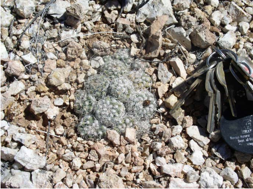
Rare cluster of Pediocactus bradyi plants with one budding cactus.