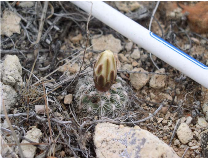
Example of typical budding cactus among limestone chips, partially submerged.