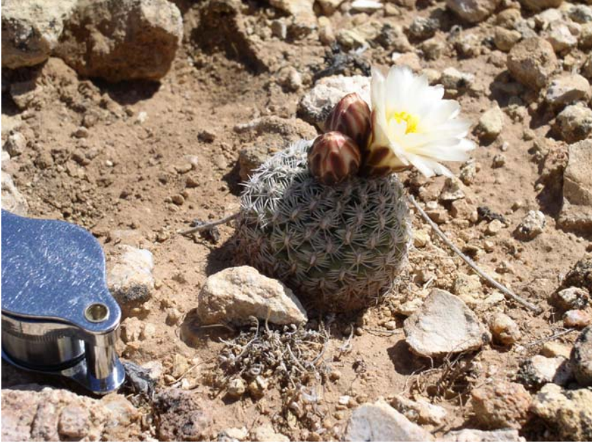
Example of fully emerged Pediocactus bradyi plant in limestone chip poor site.