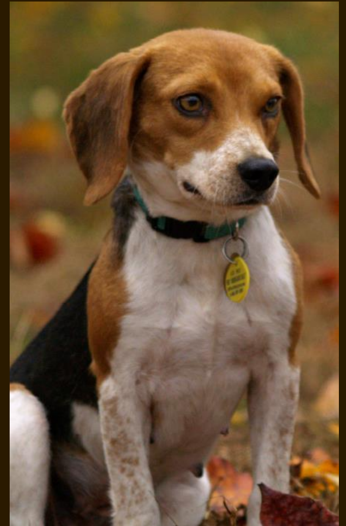
This dog has an animal license; This animals is registered