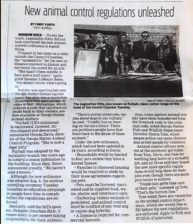
Navajo Times Article – 11/01/18