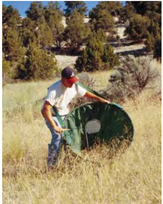
Figure 1. Collecting Asteraceae seeds with badminton racquet and a hopper made from cordura cloth sown onto a round frame.

Of course, some disparity in ripening time occurs among plants in a population. Because you may not be able to return to the site repeatedly to maximize a collection, we have experimented with collecting heads prior to full ripening. On the same day at the same site, long-leaf hawksbeard collected early (seed heads not open) had 40% viability while those collected with open heads yielded 61% viability. The effect of storage on viability of these 2 lots is unknown, but it is apparent that