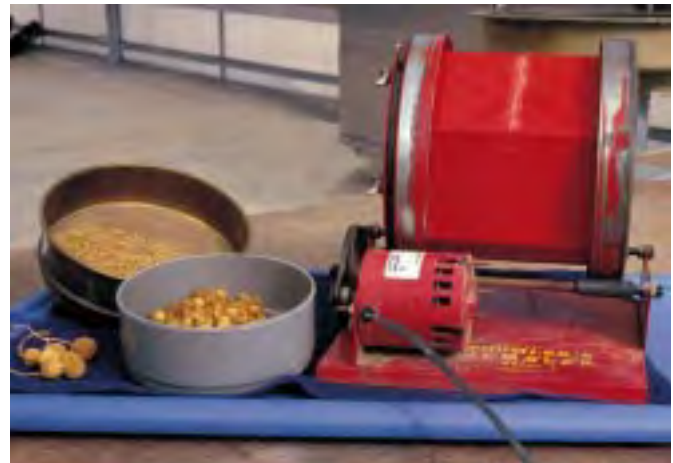
Figure 2. At Los Lunas Plant Materials Center, dry fruiting heads of Arizona sycamore, seen lower left, are crushed under water in a large pan. The hairs agglomerate into balls (gray sieve in foreground). A slurry of achenes and pea gravel are tumbled in the rock tumbler to dislodge the hairs. Finally, the achenes, hairs, and pea gravel are separated with soil sieves with the cleaned achenes visible in the brass sieve (background).