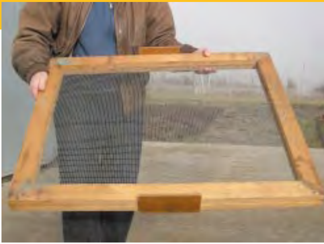
Figure 2. A wooden frame covered with hardware cloth makes an effective grass seed cleaning device.

paper bags, too. After collecting seed heads, we sit on the ground with the screen and rub the plant material vigorously a few times to dislodge the seeds from the inflorescences, which fall onto the drop cloth. We pour seeds into paper bags for transport back to the nursery.