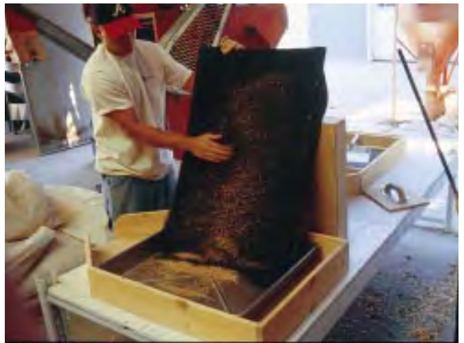
Figure 2. When tossed at a piece of felt, desired Asteraceae seeds fall into a collection pan but unwanted grass seeds, with their prickly appendages, are caught on the felt.