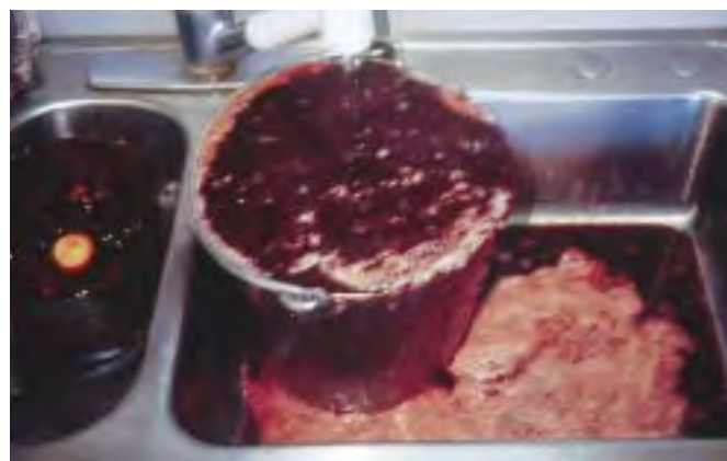
Figure 2. Floating the debris away from clean seeds.