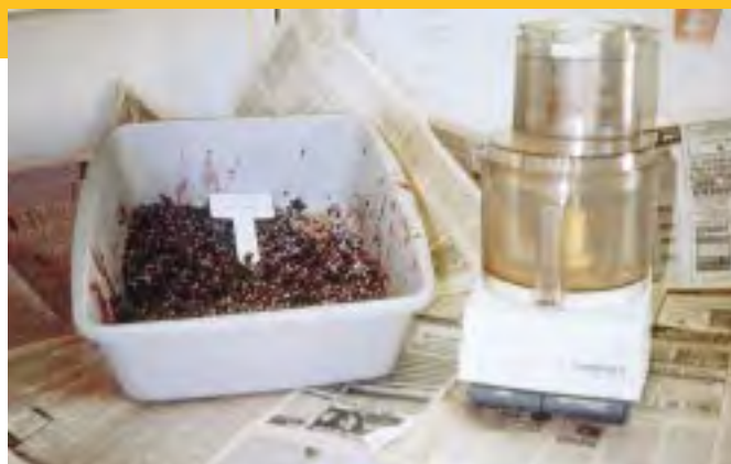
Figure 1. Elderberry fruits ready for cleaning and my trusty food processor.

USDA NRCS. 2002. The PLANTS database, version 3.5. URL: http://plants.usda.gov (accessed 14 Aug 2003). Baton Rouge (LA): The National Plant Data Center.