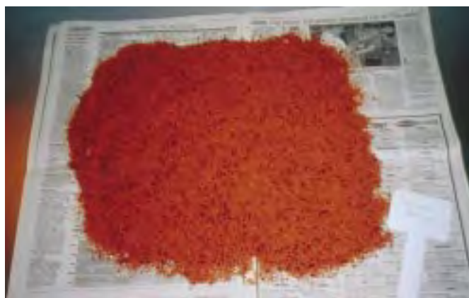
Figure 3. Clean elderberry seeds ready for storage.