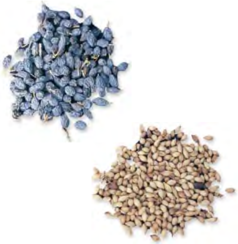
Figure 1. The pulp of naturally dehydrated fruits (top) of New Mexico olive can be removed using a rock tumbler, leaving extremely clean seeds (bottom).

For a few species, wet tumbling may partially substitute for a cold stratification requirement. Two currant species ( Ribes aureum Pursh and R. cereum Dougl. [Grossulariaceae]) and wolfberry ( Lycium torreyii Gray [Solanaceae]) generally require 2 to 3 m of cold stratification to achieve acceptable germination. Wet tumbling followed by 1 to 2 wk of storage in a warm moist environment has resulted in germination without cold stratification. The dry seeds of another important riparian species, redosier dogwood ( Cornus sericea L. ssp. sericea [Cornaceae]), generally require 1 h scarification in concentrated sulfuric acid and then 2 to 3 mo of cold stratification for acceptable germination. Using fresh fruit with hydrated pulp, rapid germination has been achieved by wet tumbling the fruit with 1 to 2 cm (0.5 to 0.75 in) gravel. Most of the pulp is removed in the first day of tumbling and separated by screening and float/sink manipulations in water. After pulp removal, seeds are wet tumbled for several more days with daily water changes. The imbibed seed is then stored in a warm moist environment; germination starts in about 7 to 10 d and continues for several weeks. Although a limited number of species have been tested with wet tumbling for seed conditioning, additional species may benefit from this treatment.