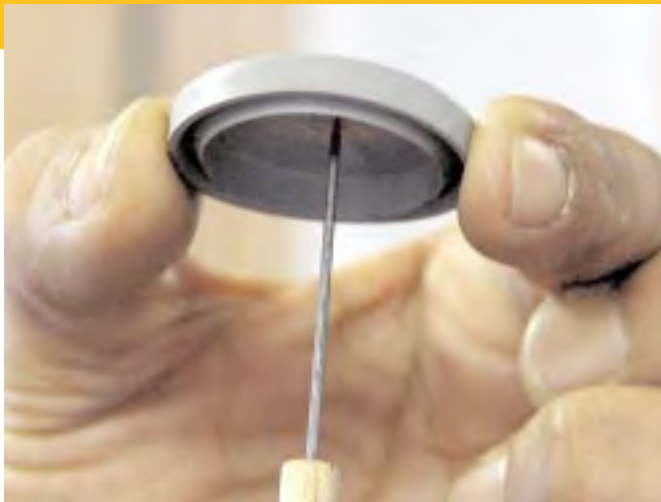
Figure 1. Melting a hole in film canister lid converts it into an inexpensive but effective device for sowing small seeds.